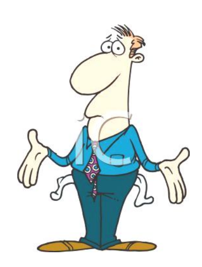
"If you are pure and upright, even now he will rouse himself on your behalf and restore you to your rightful place."